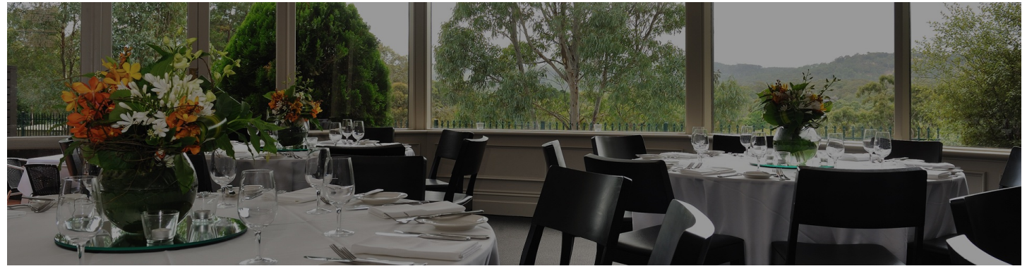
The private dining room