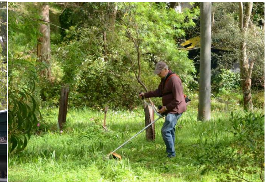
Bushed? Denis (HH) somewhere down in the valley levelling the weeds.