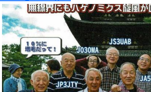
Part of an interesting card from JE2GWO. I wonder that the young lady is saying?