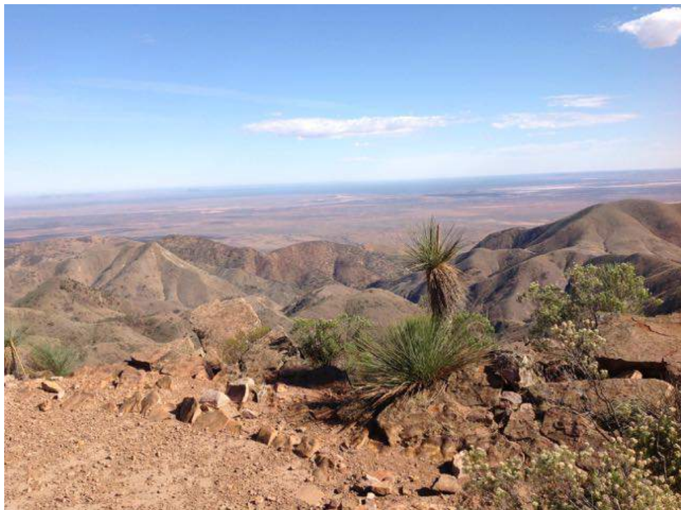
SOTA, VK5 PARKS AWARD, WWFF, PORTABLE, QRP, PEDESTRIAN MOBILE