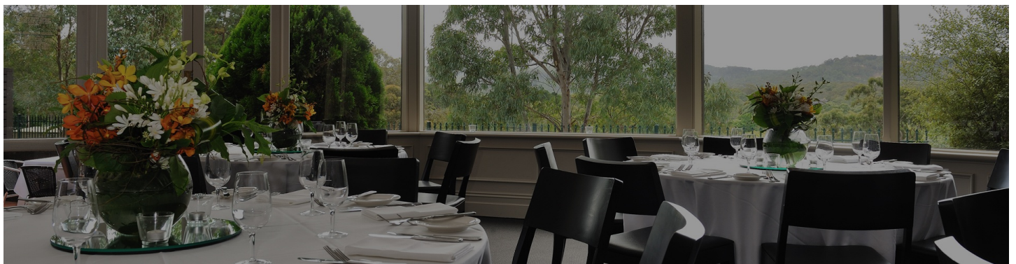
The private dining room